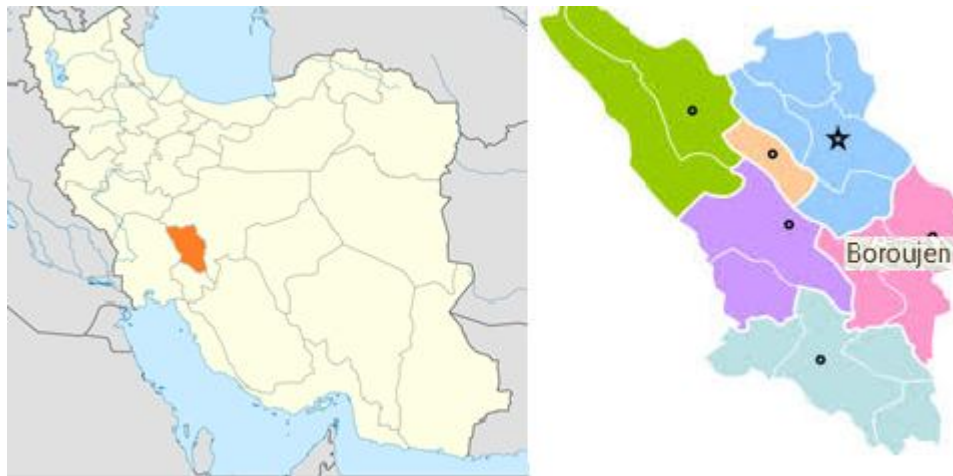
Figure 1: location of Chahar Mahl and Bakhtiari province and Borujen City on the map

Borujen city is located in central part of Borujen. Population of the city has been equal to 52694 based on statistics of 2011. The city includes historical and ancient works such as "Saghakhaneh of the region; door of caravanserai"; "Haj Suleiman Mosque"; "Big Mosque of Naghneh"; "Hafizi Home"; Ma'more Church; Maktabkhaneh Bathroom and Bazaar Bathroom and many other phenomena before and after the date. The city also includes tens tourism and religious centers and abundant handy crafts. It includes also mild cold climate with hot and dry summers.